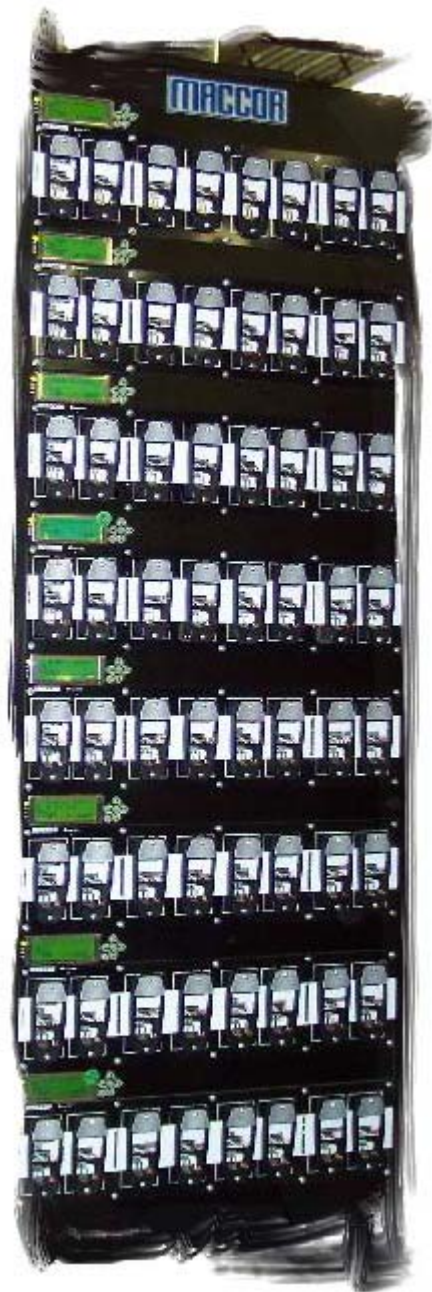
Model 5400 Cabinet